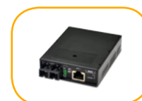
Non Wall-Mount Type